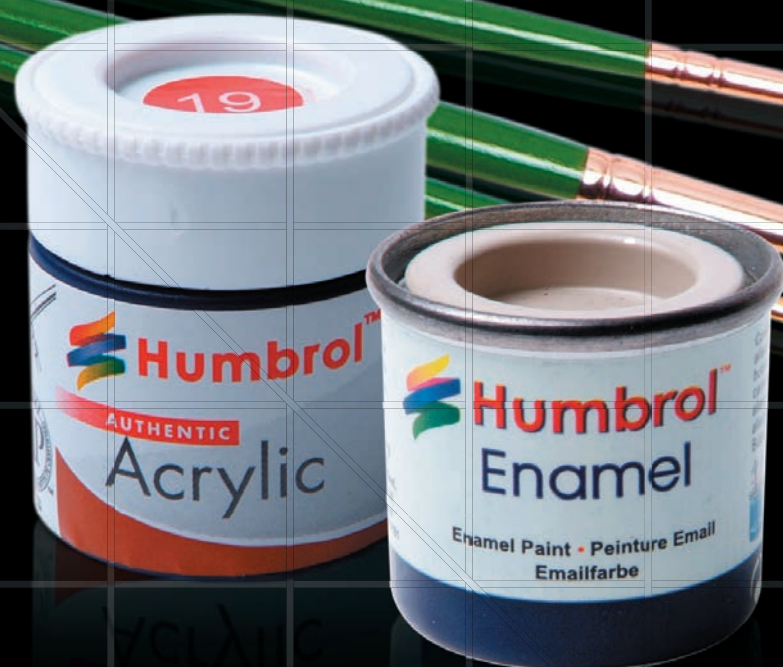
Chart code: AZ2155

Hornby Hobbies Limited Margate Kent CT9 4JX United Kingdom